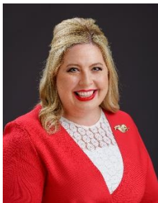
Hon Katrine Hildyard MP

Applications close midday on Friday 30 September 2022.